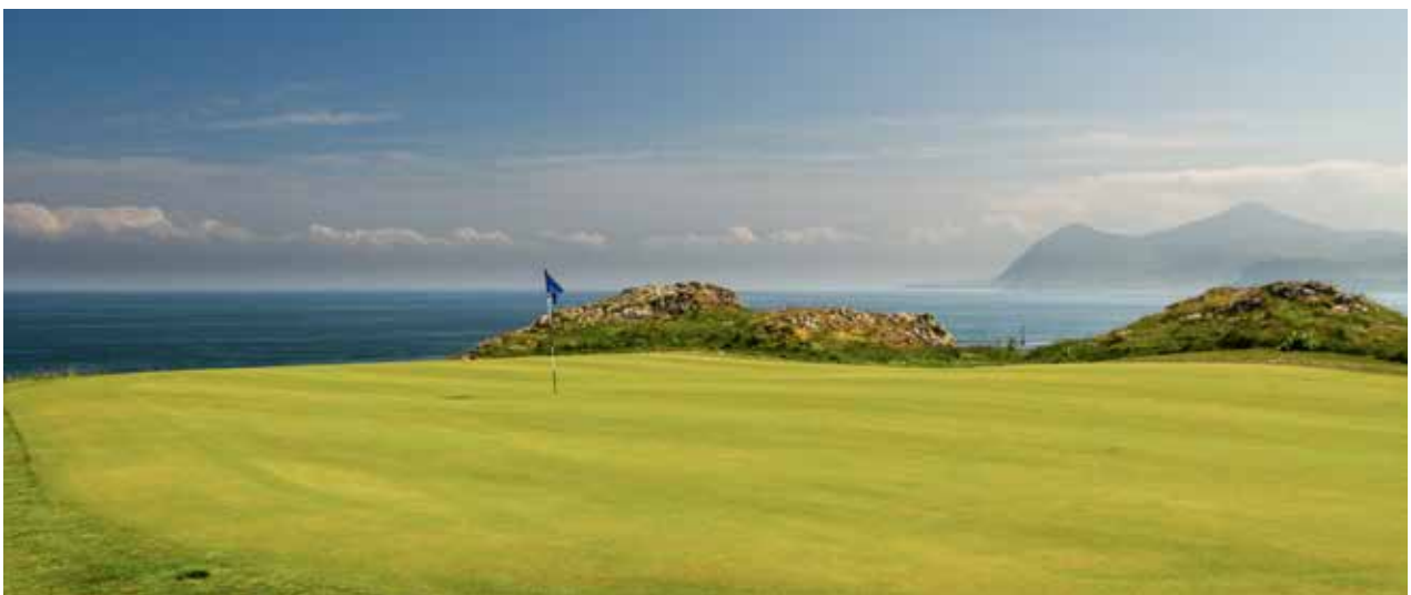
NEFYN AND DISTRICT CHAMPIONSHIP GOLF CLUB

The new developments are on the doorstep of many cultural attractions, including the picturesque, 12th-century pilgrimage church of St Bueno's which is just a short walk away. A few minutes from Nature's Point is the bustling coastal village of Nefyn, home to an award-winning links Golf Course and a variety of restaurants. A little further away are the towns of Criccieth and Harlech with their castle ramparts, alongside the upmarket coastal town of Abersoch.